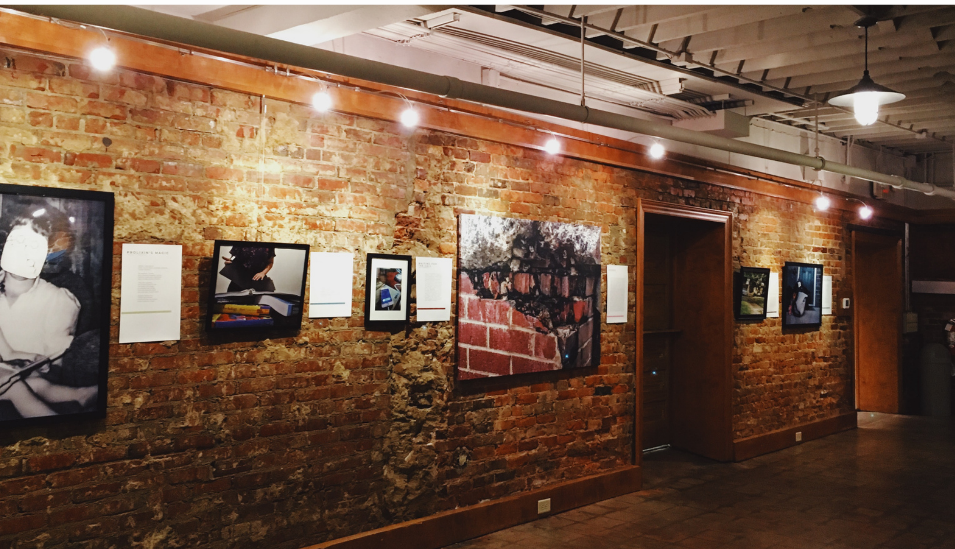
Story of Foster Care, Vol. 1 displayed at City Gallery, Raleigh, North Carolina in 2019

Link to Video Walkthrough of SOFC Gallery at NACC's 2022 National Conference in Baltimore, MD