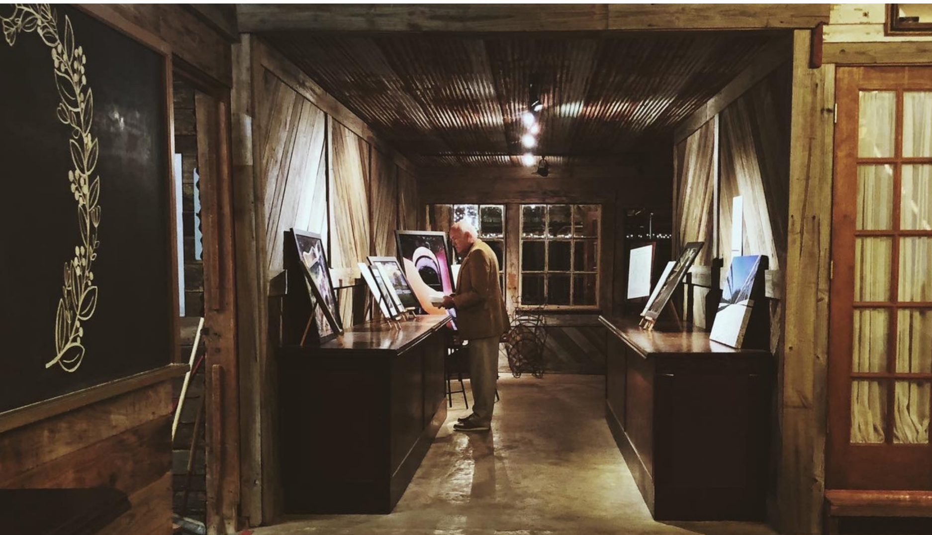
Story of Foster Care, Vol. 1 at For the Sake of One's Hope Banquet, Texarkana in 2022

Link to Video Walkthrough of SOFC Gallery at CAFO Summit 2022, Atlanta, GA